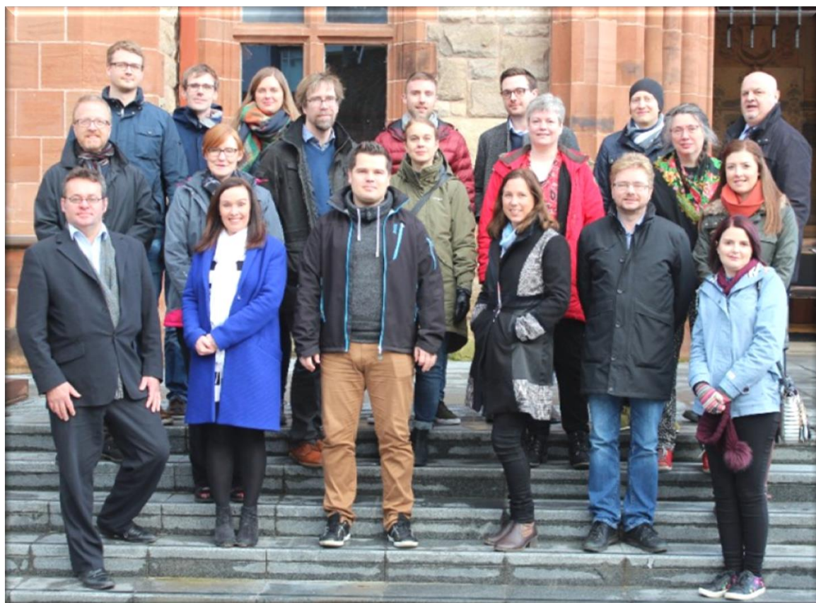
CLIMATE project partners and associate partners outside the Guildhall at the Steering Group Meeting in Derry-Londonderry November 2017.