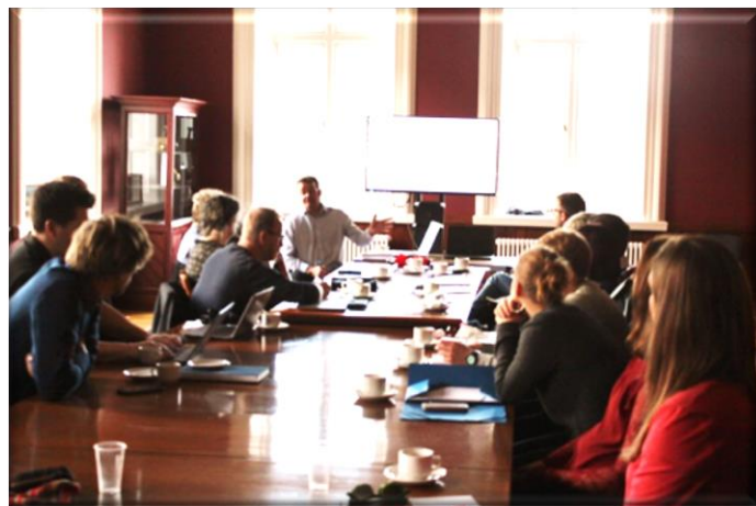
Project and Associate Partners hearing about Lead Partner Derry City and Strabane District Council's Green Infrastructure Plans

Project partners and associate partners met in Derry, Northern Ireland for the second steering group meeting. Over the course of the three days, partners were updated with progress on each project work package, had informed discussions on moving the project forward and enjoyed an informative tour of the city. It was clear that the project is progressing well and is on course with meeting its targets.